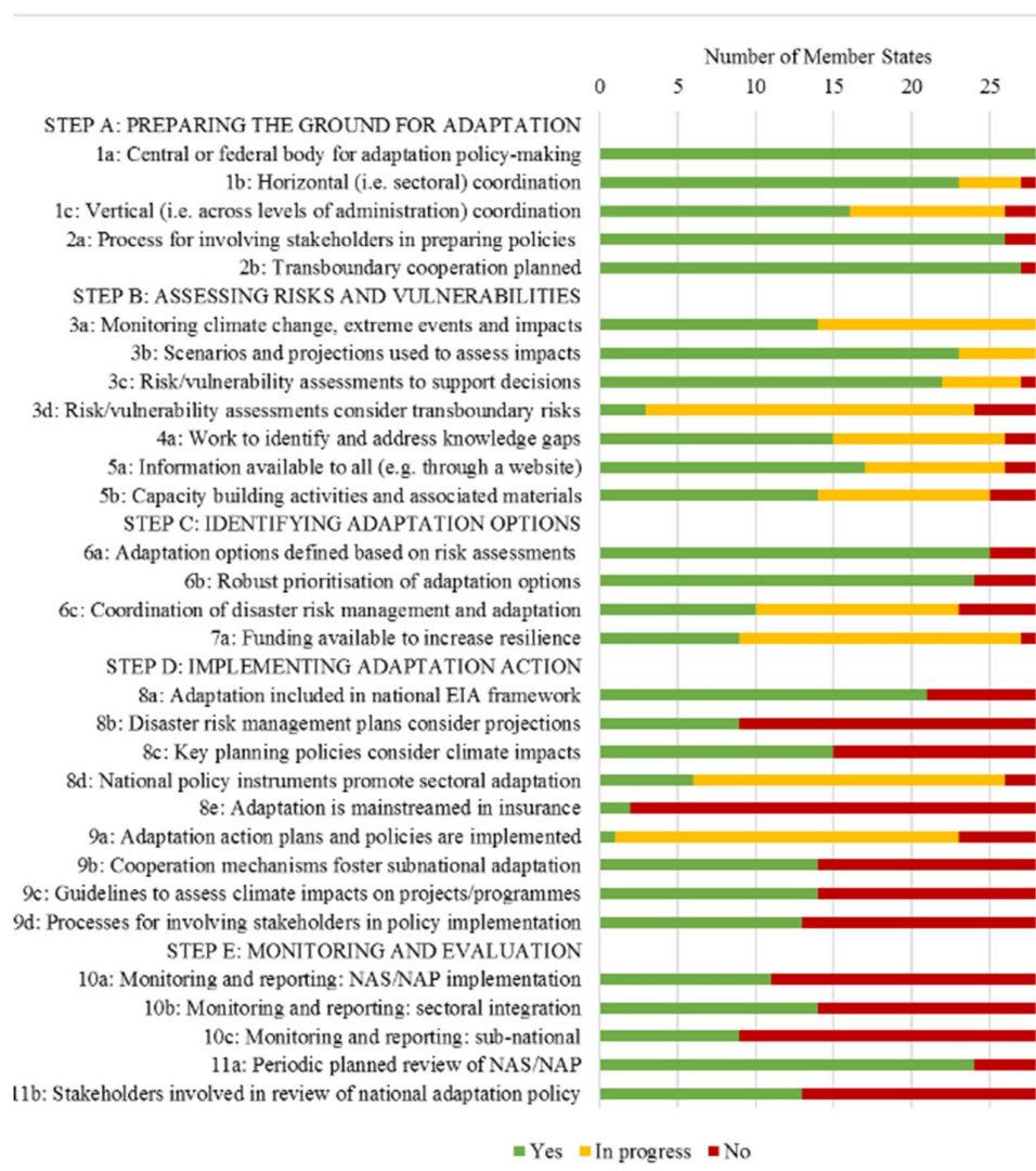
Figure 1. Aggregated adaptation scoreboard of EU member states (reproduced from European Commission 2018)