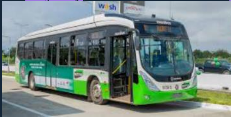
Bus Rapid Transit System, Abidjan Côte d'Ivoire