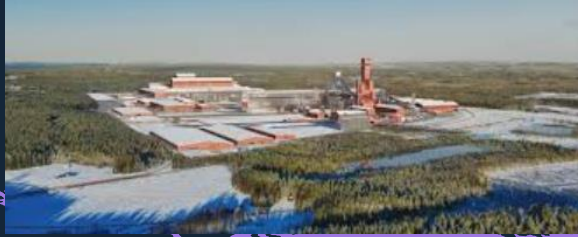
Green steel, Boden, Sweden